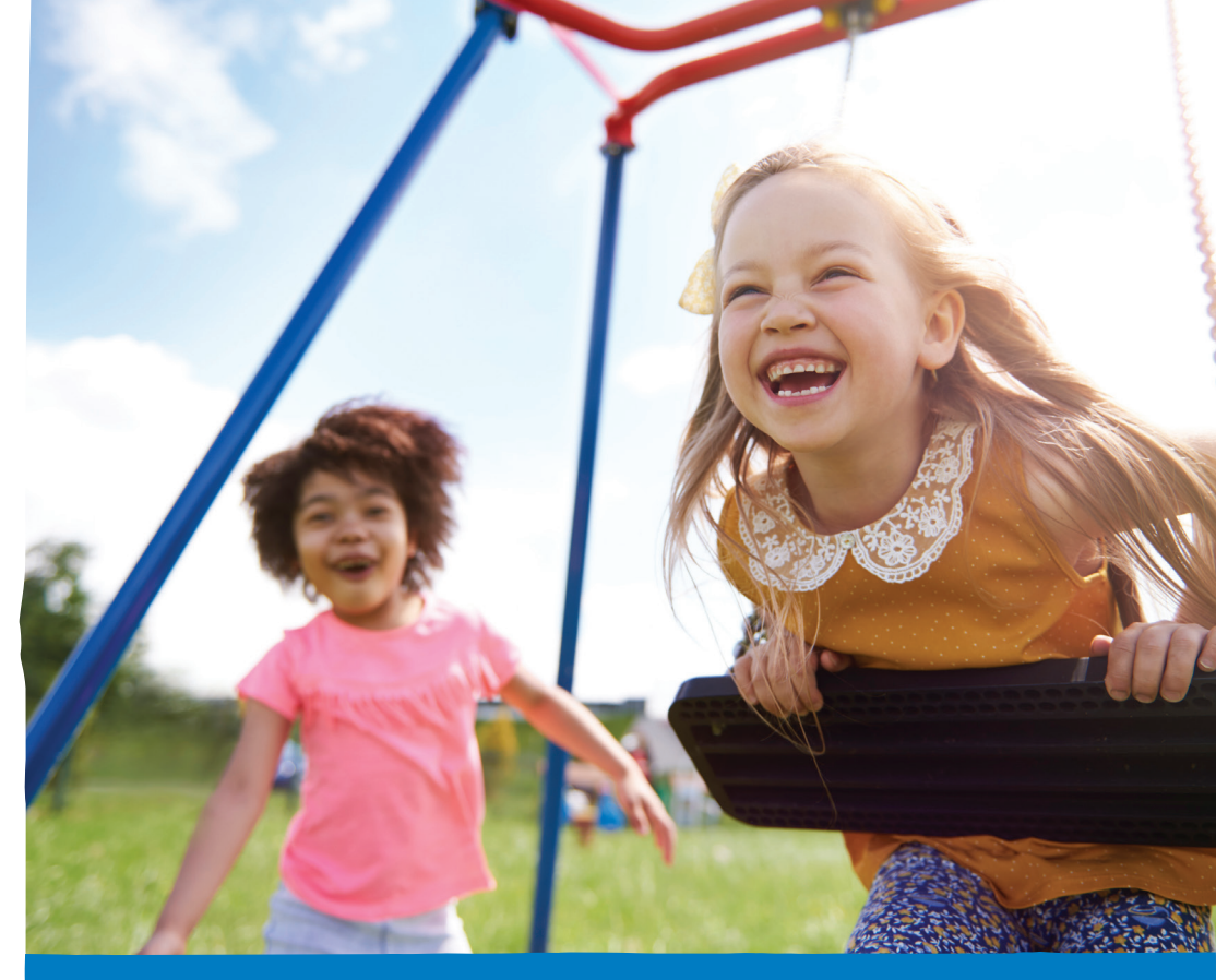
Bonding with friends – Di-buk cha-ve-rim – דָבוּק חֲבֶרִים