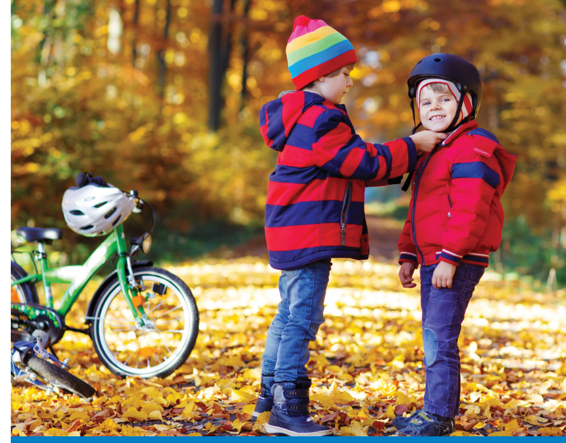
Responsibility to others - A-rey-vut - אַרבוּת