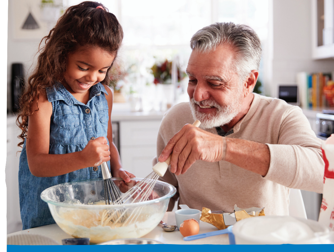
Learning from everyone – Lo-med mi-kol a-dam לוֹמֵד מִכּלׁ אֲדַם