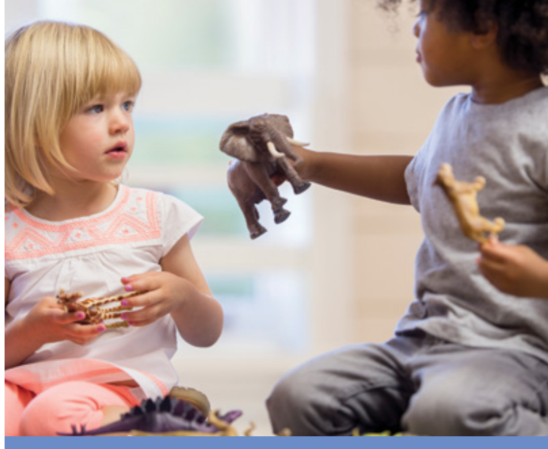
Good manners – De-rech e-retz – אֶרֶך אֶרֶאָ אָרֶן