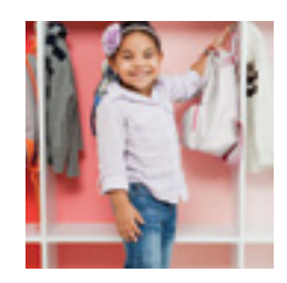
Put things in your cubby