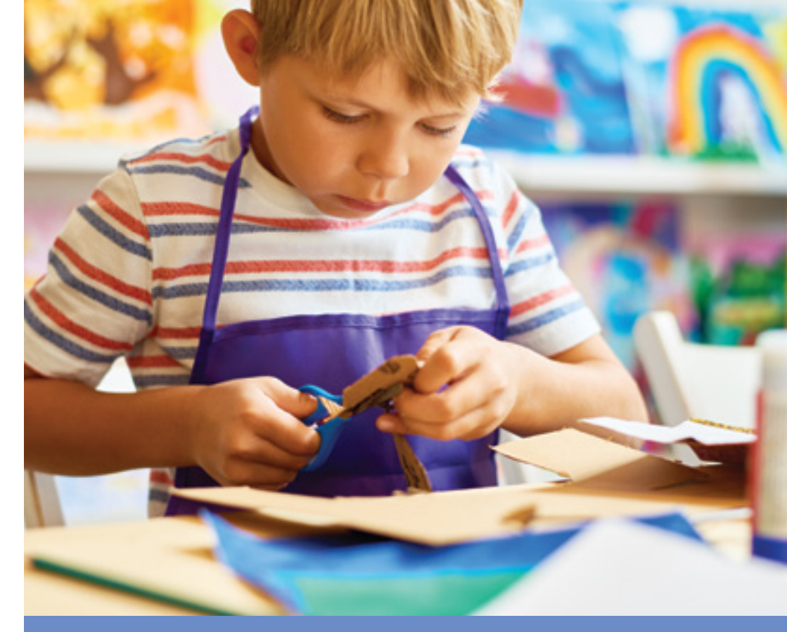
Do not waste - Bal tash-chit - בַּל תַּשְׁחִית