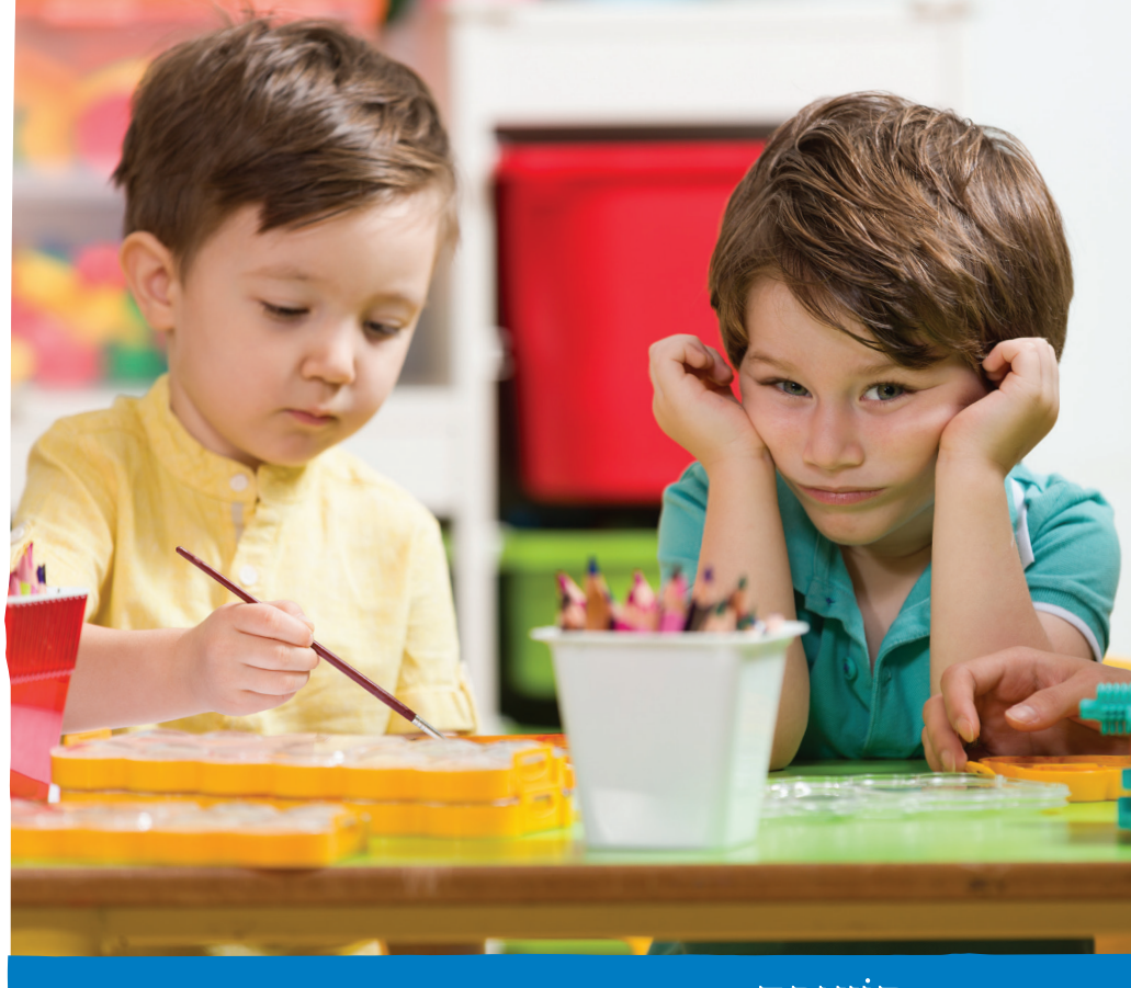
Fixing mistakes - te-shu-va - הַשוּבָת