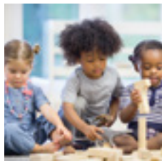
Free-play time in centers