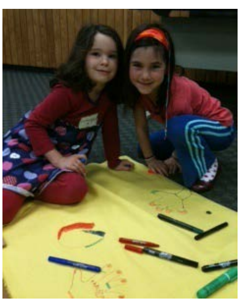
Children decorate blanket for senior citizens' home

"So let's all get up and do a quick stretch (first the arms, then the fingers, then your toes!), and then go find a seat at one of the tables."