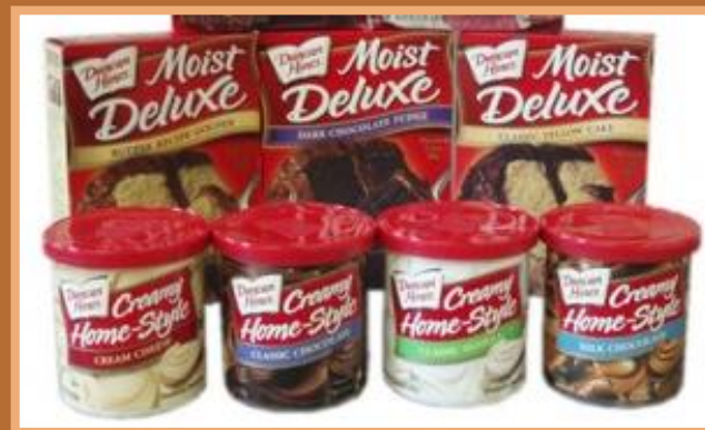
Metro West- NJ-donated birthday cake mixes and frosting ; made birthday cards